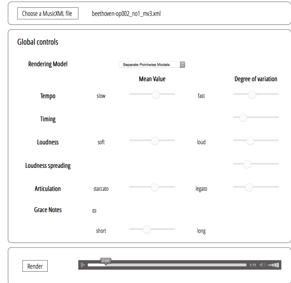
Figure 2. Prototype UI for the Web App.

parameters, we use the network outputs to parametrize a Gaussian mixture distribution, resulting in Gaussian mixture density RNNs [6].